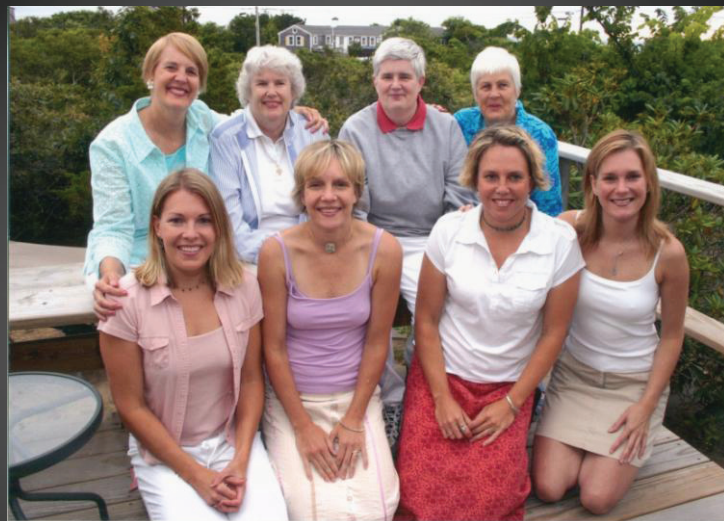
Four Hodges sisters and four Heiser sisters at Cape Cod 2004